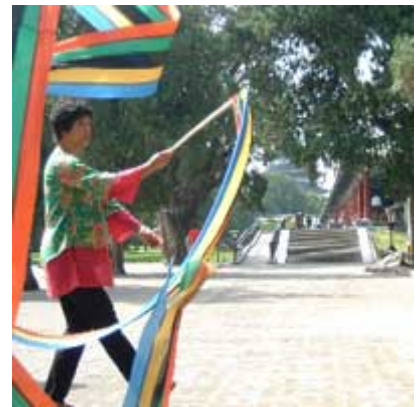
Beijing with Kids