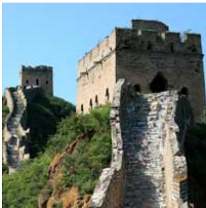
Free (or Almost Free)

Click on the photos below to download printable guides from the travel experts at Fodor's.